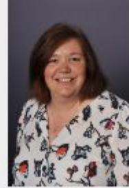
Ms Finch Lyceum SSM - Key Stage 4