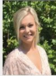
Ms Brewer Lyceum SSM - Key Stage 3